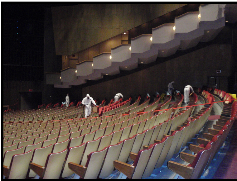
Lead dust abatement in theatre